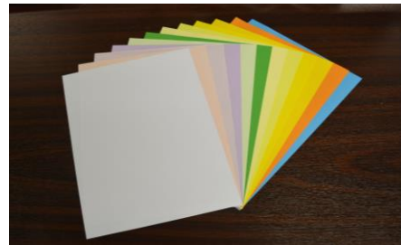
Other Colour options are available