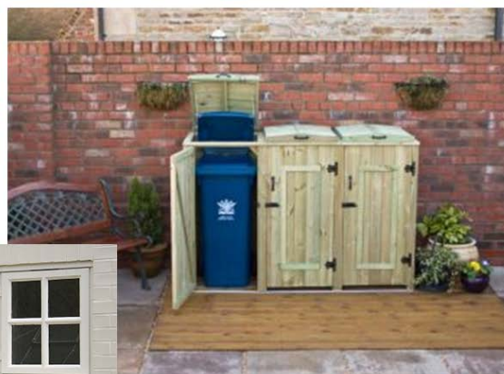
These stores may be appropriate to the frontage of a property if no rear access possible.